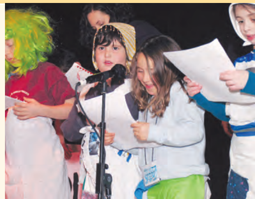
Baby bubbehs at KlezKamp's 2007 KlezKids program